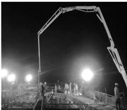
(a) Light pollution in construction