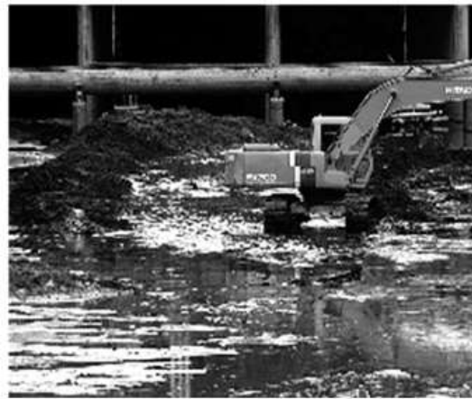
(b) Water pollution in construction