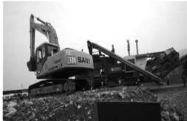
Fig 3: Construction waste discharge point

The discharge point or end treatment point in construction refers to the final treatment position before construction pollutant discharge, as shown in Figure 3. According to the establishment of sewage points, improving the quality of sewage, and then discharging, which is a common way of water pollution control in construction. Although the pollutant emission location is a remedial strategy, it can have an immediate effect.