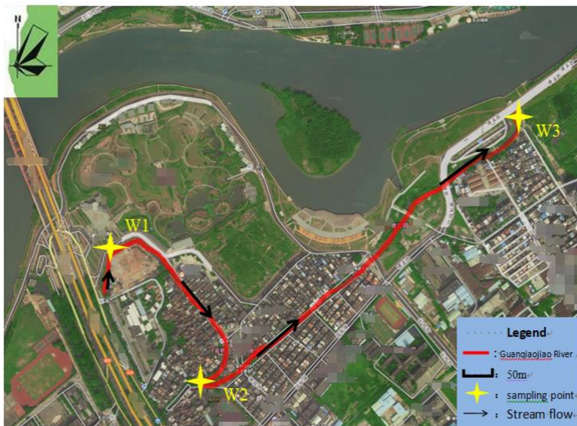
Fig 1: Layout of sampling points of Guanqiaojiao River