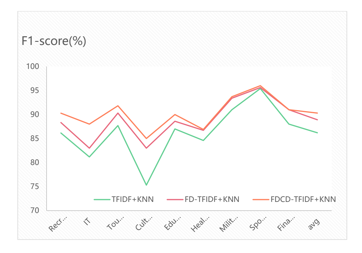
Fig 2 classification results of KNN used by original TFIDF algorithm, fd-tfidf algorithm and fdcd-tfidf algorithm