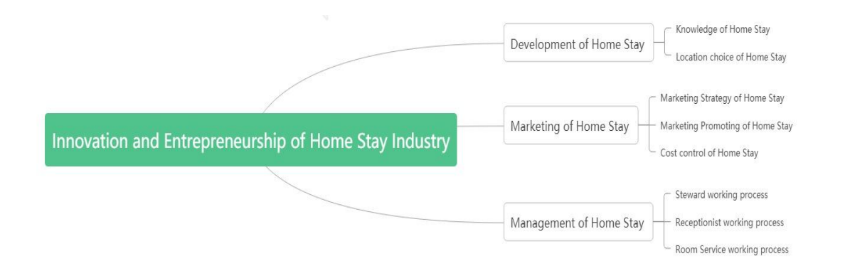
Fig 3: Course design of entrepreneurship practice in homestay industry

4.5 Making Use of Information Technology to Support Various Forms of Teaching and Improve Lifelong Learning Ability