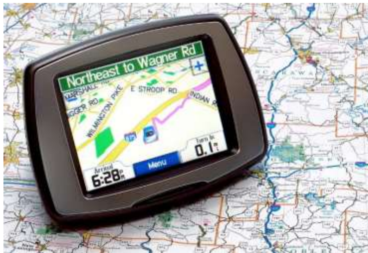
Fig. 1. GPS positioning information system

The original intention of monitoring is to pay close attention to the objects to be monitored, including people, things, places, etc. In traditional criminal investigation, crime monitoring mainly depends on manpower, which is time-consuming, laborious and inefficient. In the era of big data, we can rely on various monitoring equipment for data monitoring. This "panoramic open monitoring" covers both space and time. Data monitoring is an important means of crime monitoring. The premise of data monitoring is that the data application platform stores a sufficient amount of crime related data. In the data-driven investigation mode, investigators rely on the data application platform and use big data technology to analyze and judge the crime related information, so as to reduce the dependence on causality. Turn attention to the correlation analysis of crime data, and the processing results of data application platform analysis provide direction guidance for investigators to carry out investigation activities. Using big data technology to analyze data information can get rid of the subjective defects of crime analysis in traditional crime investigation, highlight the objectivity and stability of big data analysis results, and improve the accuracy of investigation decision-making.