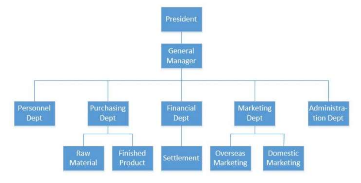
Fig 1: Organization chart of Z Enterprise Financial Sharing Center

At the same time, according to the business needs of enterprises to be included in financial sharing, the positions of capital operation, operation management, file management, Accounting Director, material accounting, cooperative construction accounting, ship machinery accounting, expense accounting, salary accounting, audit, income accounting, tax accounting and reporting are set up according to the business scope, as shown in Figure 1.