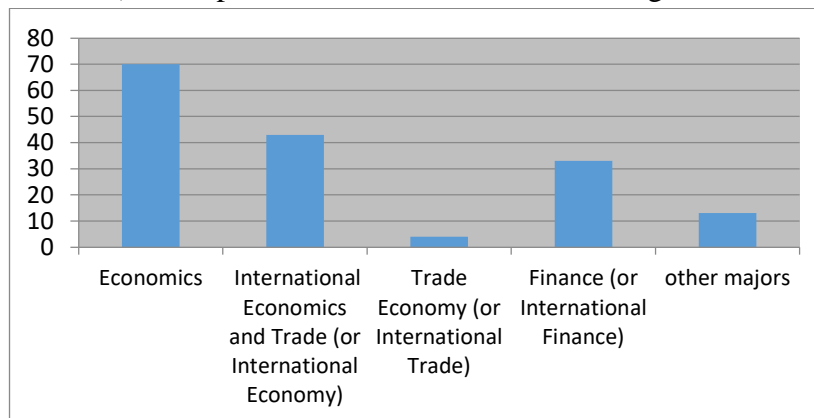
Fig 2: Distribution graph of proportion of majors among 163 majors in 81 universities

Among the 163 majors in 81 universities, there are 70 majors in Economics, 43 majors in International Economics and Trade (or International Economy), 4 majors in Trade Economy (or International Trade), and 33 majors in Finance (or International Finance), 13 other majors (such as Financial Engineering or Insurance, Public Finance, etc). The specific distribution is shown in Figure 2.