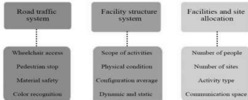
Fig 3: Layout planning elements of facilities in old industrial residential areas