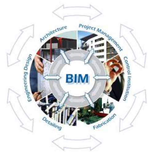
Fig 1: BIM software type

The practical application of BIM Technology in engineering project is not only realized by a BIM software or a certain type of BIM software, but also by mutual integration and cooperation between BIM software [9-10].