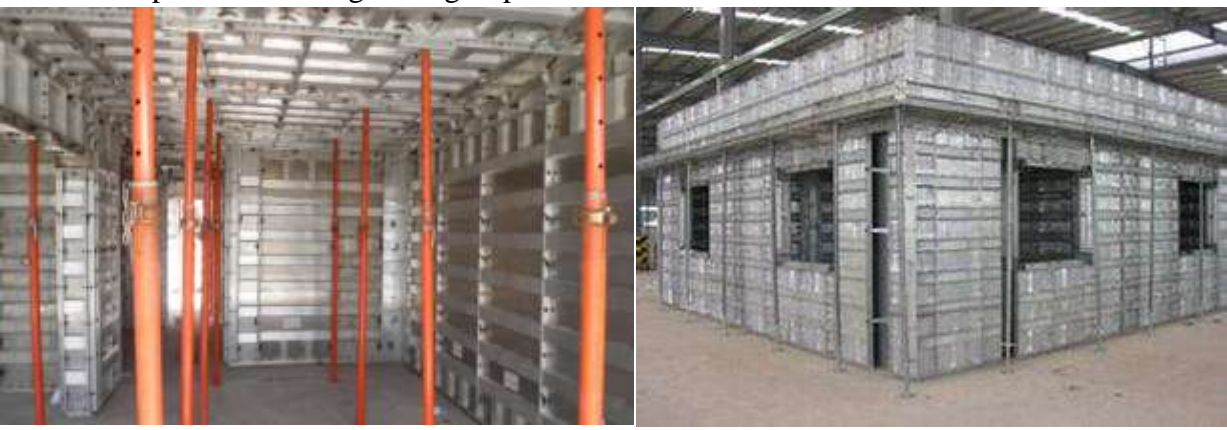
Fig 2: Basic usage of BIM

Through the research of the enterprises using green BIM Technology in the United States, it is shown that in the early stage of BIM practice, BIM is often used as a modeling tool, and it is only applied to visual design, collision detection, improving the output efficiency of engineering drawings, etc., but it is lack of further analysis through model data. However, this phenomenon will be changed with the introduction of green BIM concept and the strengthening of practice.