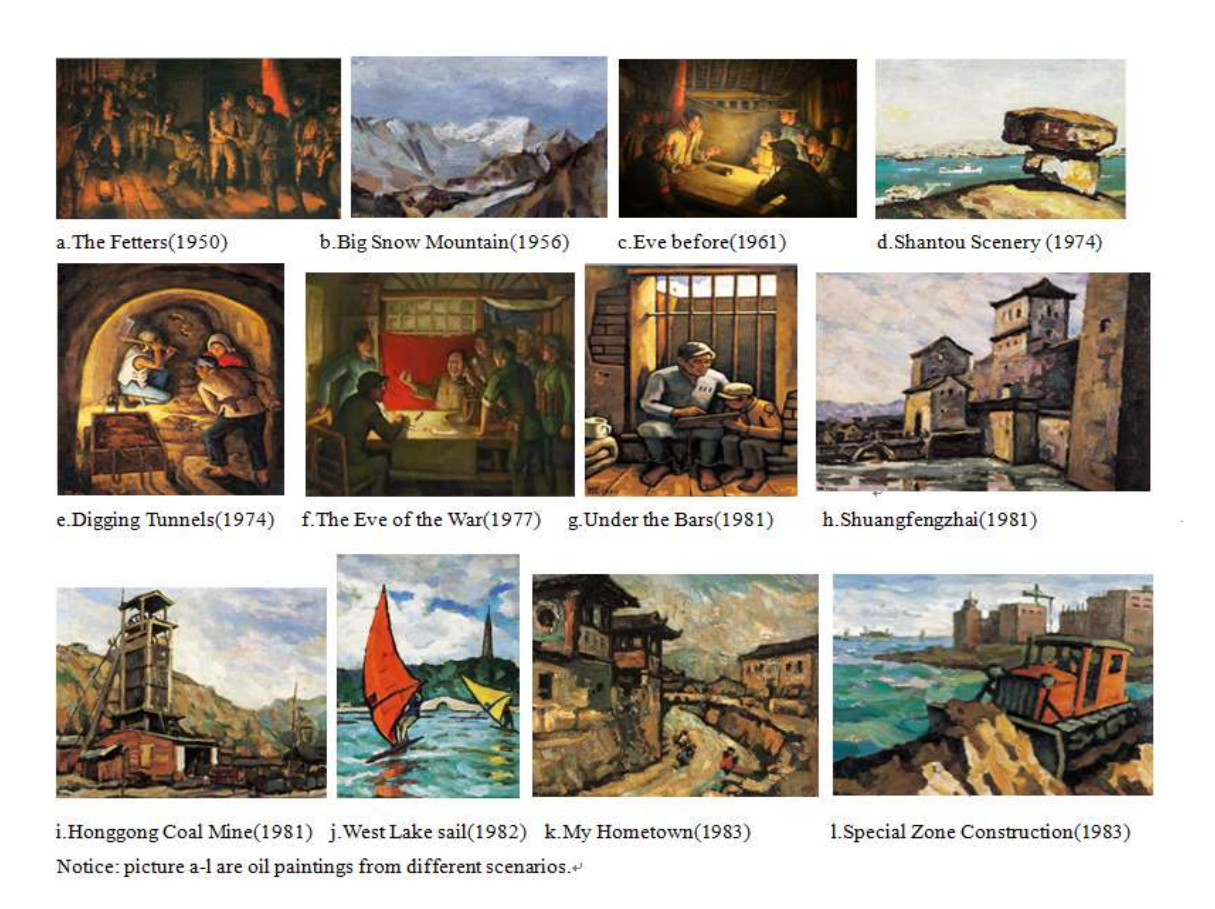
Figure 4 Hu Yichun's oil printings

Bunker" "Night Attack" "Lugou Bridge Battle" "Changle Village Battle" "Destruction of Traffic" and "Snatch" in 1939; "Military-civilian Cooperation", "Persist in the War of Resistance Against Surrender", and "Ten Tasks" in 1940; the created mimeograph and color woodcuts "Digging a Hole" and "Bombing" in 1942; "Niu Ju Changed Workers Team" and "No Enemy Allowed to Pass" in 1943; the chromatic woodcuts "Trench Digging" "Return of Victory" in 1944; chromatic woodcuts "Digging a Hole" and "Siege" and created a large-scale propaganda poster "Building a Democratic and Prosperous Zhangjiakou" in 1946 (Figure 3, Table 2).