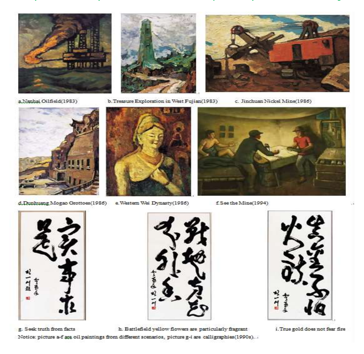
Figure 5 Hu Yichun's oil printings and calligraphies