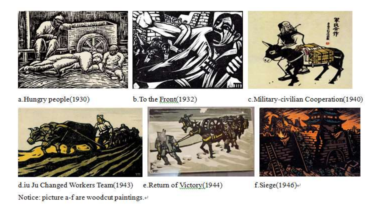
Figure 3 Hu Yichun's woodcut printings

Article History: Received: 12 May 2021 Revised: 25 June 2021 Accepted: 22 July 2021 Publication: 31 August 2021