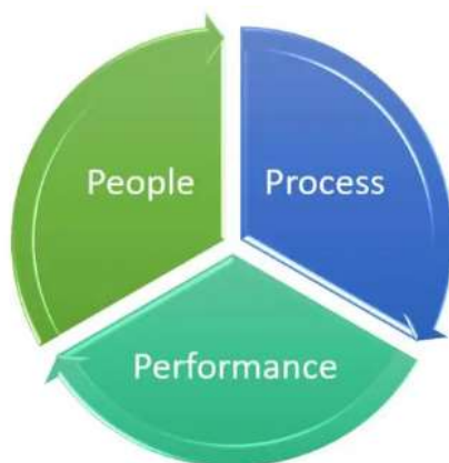
Fig 2: Intellectual property management promotes the virtuous circle of independent innovation in knowledge intensive manufacturing industry

In the process of developing new knowledge achievements in knowledge intensive manufacturing enterprises, by querying the completed knowledge achievements such as relevant intellectual property rights and technical secrets in internal and external knowledge databases, it can reduce repeated R & D and improve R & D efficiency; The sharing and exchange of intellectual property information and the paid transfer of technology are conducive to the dissemination of innovative knowledge achievements, the optimal allocation of technical resources within, among and with other types of enterprises in knowledge intensive manufacturing enterprises, and the formation of independent intellectual property rights in key fields.