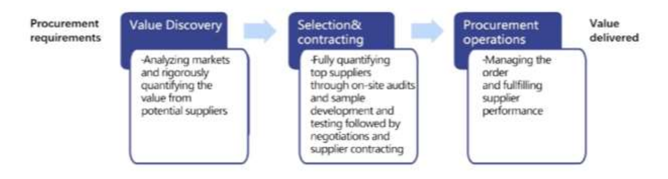
Fig 2: Supply chain management performance measurement

It can be seen that forest products enterprises and farmers in Anshan have higher and higher recognition of forest products, and more and more enterprises realize the huge economic benefits that e-commerce can bring to them. At the same time, more participation also shows that people have more and more requirements for the standardization and mode of e-commerce transactions. It also puts forward higher requirements for the degree of specialization. The future development needs to fundamentally improve the comprehensive quality of forest farmers and enterprises, and speed up the training of new forestry talents with culture, technology and management.