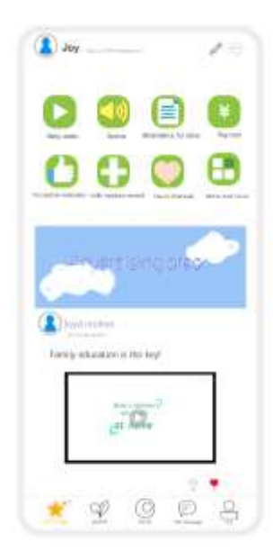
Fig 6. Parents port interface design

Secondly, set up an on-line data analysis platform to collect and analyze data such as school-based data on children's learning ability, data on children's growth and development, data on children's psychological behavior in various activities, etc., so as to provide comprehensive and scientific information on children's learning and growth for parents. Simultaneously pay attention to the data security and the privacy protection.