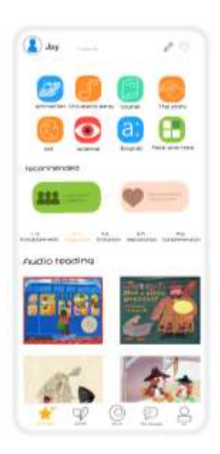
Fig 5. Young children port Interface design

Article History: Received: 10 May 2021 Revised: 20 June 2021 Accepted: 18 July 2021 Publication: 16 November 2021