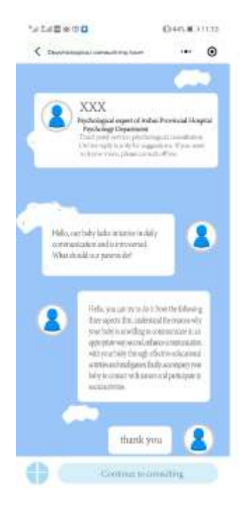
Fig 2. Interface design of information query section