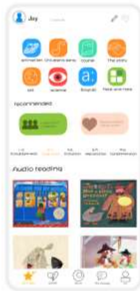
Fig 5. Young children port Interface design

Safety protection knowledge: On the one hand, provide small videos, animation and other children's favorite ways to publicize and explain safety protection knowledge. At the same time, interactive small games are set up to let children know which are dangerous objects, which are dangerous actions, how to ensure their own safety when they are at home, etc. On the other hand, the platform opens online intelligent voice consultation mode for personalized question.