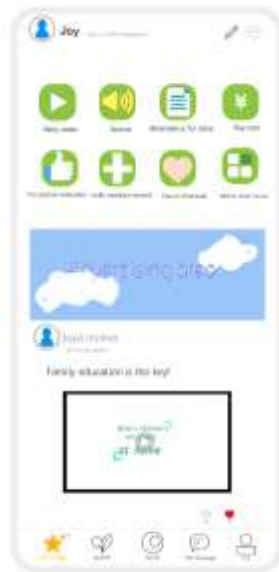
Fig 6. Parents port interface design

Secondly, set up an on-line data analysis platform to collect and analyze data such as school-based data on children's learning ability, data on children's growth and development, data on children's psychological behavior in various activities, etc., so as to provide comprehensive and scientific information on children's learning and growth for parents. Simultaneously pay attention to the data security and the privacy protection.