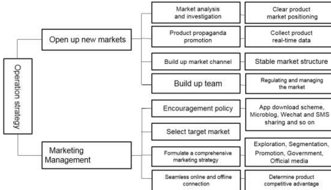
Fig 7. Operation strategy