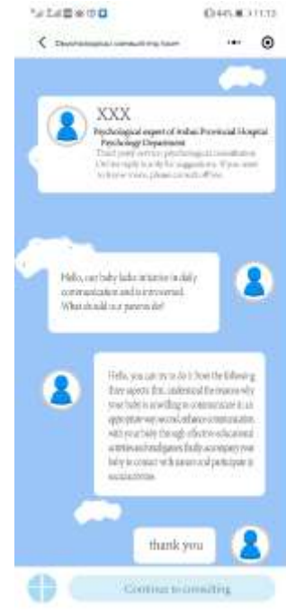
Fig 4. Interface design of advisory message section