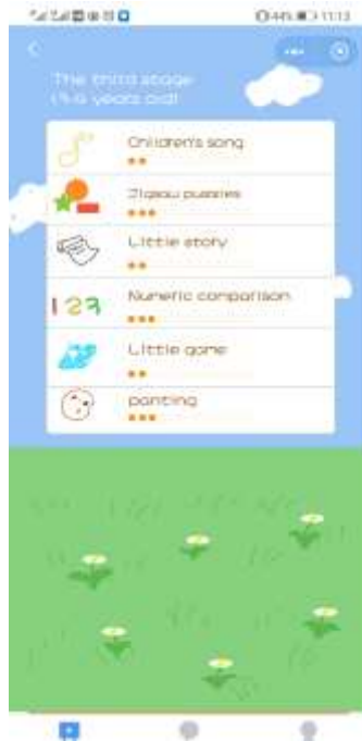
Fig 3. Interface design of learning section