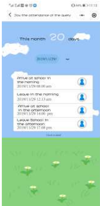
Fig 2. Interface design of information query section