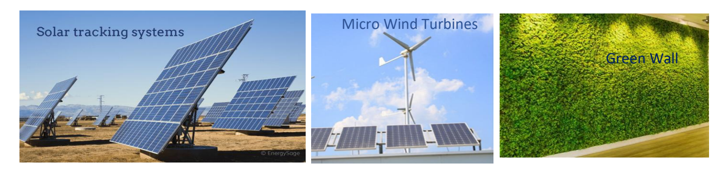
Figure 3: Figure showing (a) Solar Tracking PVs, (b) Micro Wind Turbines and (c) Green Wall

Got the privileged to work with an architects and sustainability consultants for this project, the new building will retain most of the energy conservation features, additionally some new features will be incorporated in the new building. The energy generation will mainly be through the Solar Tracking PVs , in addition the wind energy through Micro Wind Turbines will also contribute in energy generation (Figure 3). Biogas produced at the site through waste organic materials will also contribute to the energy demand of the net zero building. Piezoelectric appliances/floors for generate the electricity for through human motions.