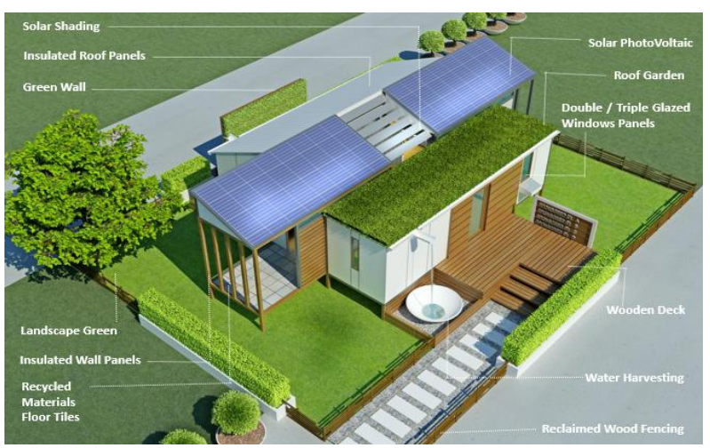
Figure:1 A concept of NZEB