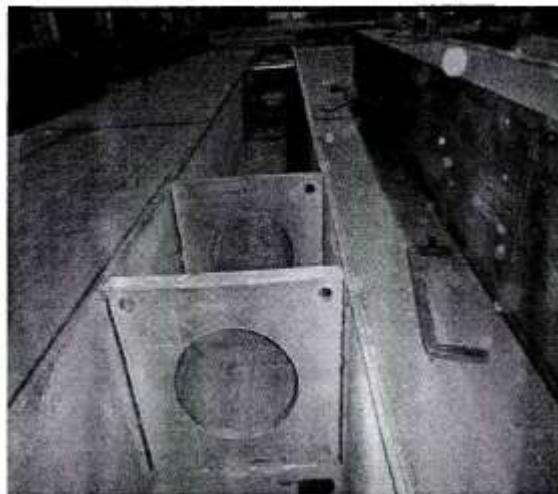
Fig 3: Construction of inner diaphragm of rectangular steel tube column

In the concrete jacking operation of the column core, the internal structure of the steel column must be able to make the pumping concrete pass smoothly. All steel tube inner diaphragms shall be provided with a single hole for concrete pouring, and the hole diameter shall not be less than 200 mm. Air holes shall be set at the four corners of the inner diaphragms, and the hole diameter shall be 25 mm. See Fig. 3 for details. A round hole with a diameter of 150 mm is opened at the lower part of the column limb, and the pipe is welded, 650 mm away from the floor structure layer, so as to facilitate the operation of workers.