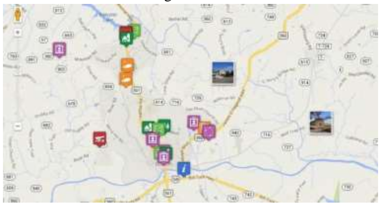
Fig 1: Tourism map of Sipsongpanna City

As a major basic core project of big data industry, Lunan data center has settled in Sipsongpanna, which is the largest green and flexible big data center in Shandong Province and even Huaihai economic zone. Sipsongpanna tourism big data is listed as one of the "1616" key projects of Lunan big data center. The construction of Lunan big data center can provide policy, software, publicity, technology and other support for the construction of Sipsongpanna smart tourism service platform based on big data. Generally speaking, Sipsongpanna has a congenital advantage in terms of basic conditions. See Figure 1 below for details.