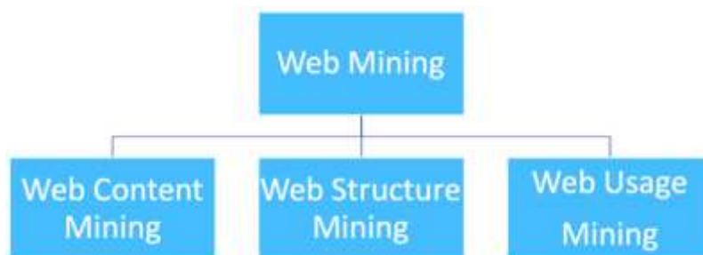
Fig 2: System overall data flow chart