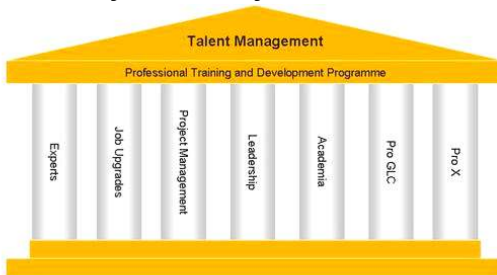
Fig 1: Conceptual diagram of I2I talent training mode

are constantly changing. Higher vocational talents training should comply with the changes of human capital demand of industry and industry, and carry out the changes of talents training level, specialty setting and other related objectives and measures. But the reality of vocational education is not so, the existing vocational education resources are still in a low level of development stage, the school level is low. The scale of secondary vocational schools accounts for more than 90% of the total vocational education, while the proportion of higher vocational colleges is extremely unbalanced, which makes the contradiction between the supply of senior vocational and technical talents and the demand for talents in the rapid development of economic production more prominent. On the one hand, there is a serious shortage of senior vocational and technical personnel, and on the other hand, a large number of general vocational and technical personnel can not get good employment due to various reasons. Conceptual diagram of I2I talent training mode is shown in Figure 1.