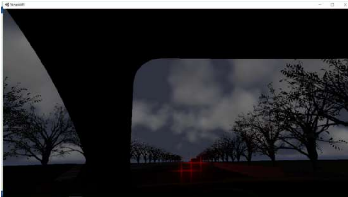
Fig 5: Car driving under night blindness

Peripheral Vision loss. Taking picking under peripheral vision loss task as an example, the user simulates the one with peripheral vision loss as picking and reading a newspaper. The User is required to pick up the newspaper in 15 seconds. If the task fails, can select the reset button (See Fig. 6)