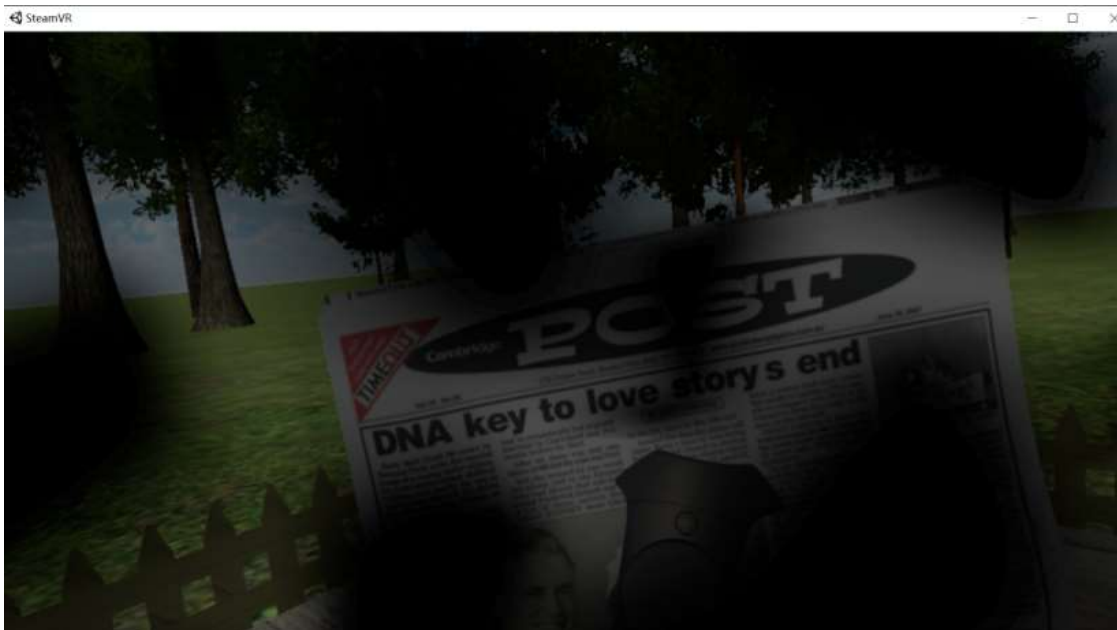
Fig 6: Picking under peripheral vision loss

Peripheral Vision loss. Taking picking under peripheral vision loss task as an example, the user simulates the one with peripheral vision loss as picking and reading a newspaper. The User is required to pick up the newspaper in 15 seconds. If the task fails, can select the reset button (See Fig. 6)