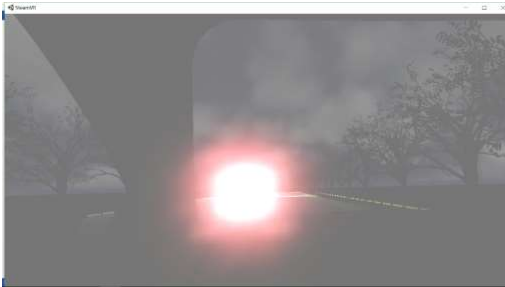
Fig 7: Car driving under contrast difficulty

the one with contrast difficulty is settled in a car, task instructions are shown as text on the windows and explained by a voiceover. Users with simulated contrast difficulty would be demanded to avoid oncoming cars with bright light, If the task fails, a scenario simulating a car accident would be shown (See Fig. 7).