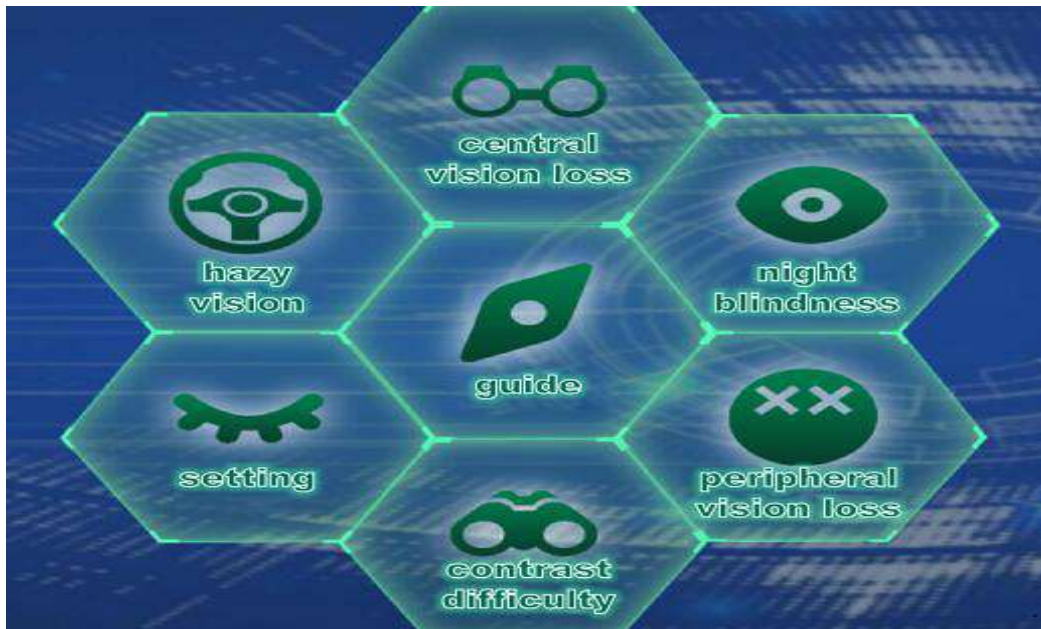
Fig 1: The main menu interface

Log in to the main menu, we can choose different simulation scenarios through the controller, and we can learn the operating rules of the application (See Fig. 1).