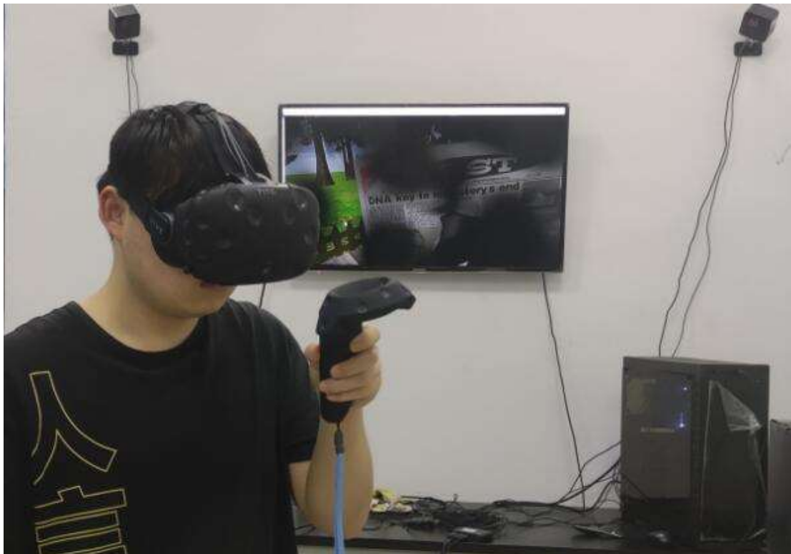
Fig 8: Experiencer under low vision simulation