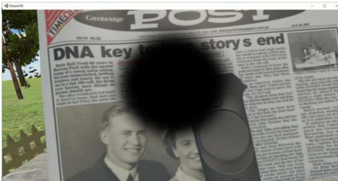
Fig 4: Reading under central vision loss

Central Vision loss. Taking reading under the central vision loss task as an example, the user simulates the one with central vision loss as reading a newspaper. There is always a black spot in the center of sight. The user would be asked to read out a sentence highlighted with an underline in the center of his visual field within no more than 1 minute, and the completion criteria of the task were hinted at mainly by voiceover (See Fig. 4).