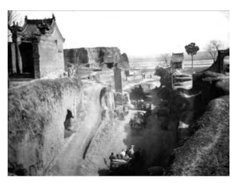
Figure 2. Landscape of villages on the loess tableland near Xi'an Prefecture in Guanzhong Plain

Article History: Received: 02 April 2022, Revised: 15 April 2022, Accepted: 24 April 2022, Publication: 04 May 2022